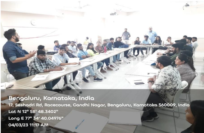
Fig: 1.1 PLACEMENT TRAINING SERIES: GROUP DISCUSSION in 17, Seshadri Rd, Racecourse, Gandhi Nagar, Bengaluru, Karnataka 560009, India